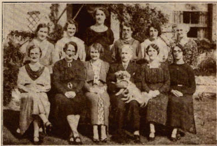
THE HOLIDAY HOMES STAFF