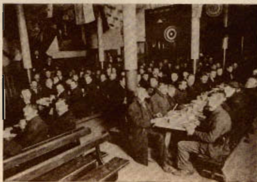
UNEMPLOYED MEN'S CHRISTMAS DINNER