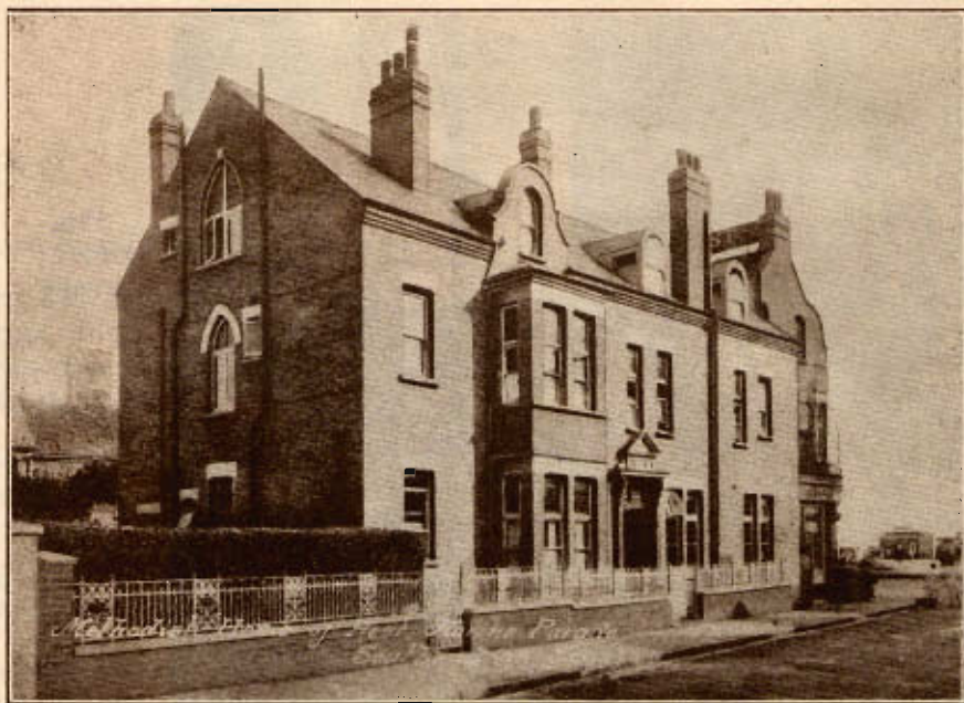
HOLIDAY HOME No. 1 (HOME OF REST)