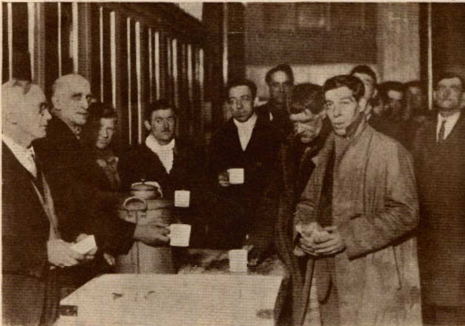
HOMELESS MEN RECEIVING THEIR RATIONS

Hope without humiliation, the chance of Redemption which covers both body and soul, is what we offer and what is gratefully received.