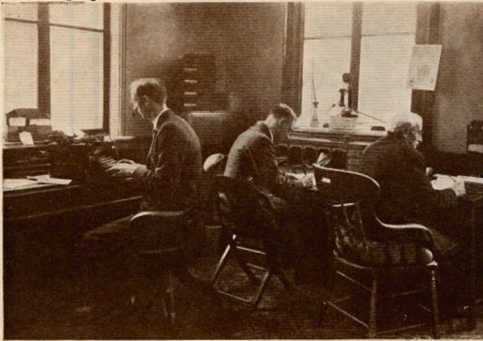
THE OFFICE STAFF