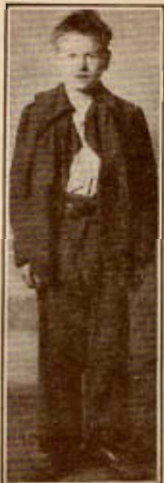
AS HE WAS