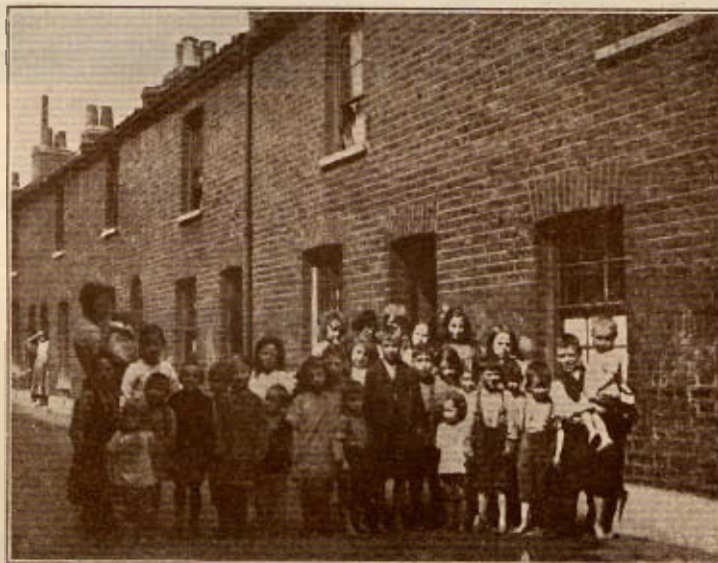
THESE LITTLE ONES ARE OUR PARTICULAR CARE