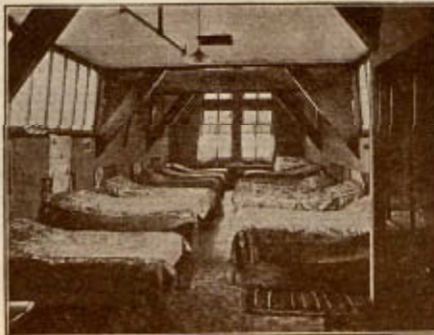
CORNER OF DORMITORY