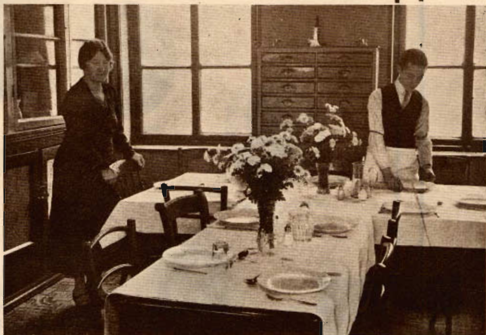
THE LADS' DINING ROOM