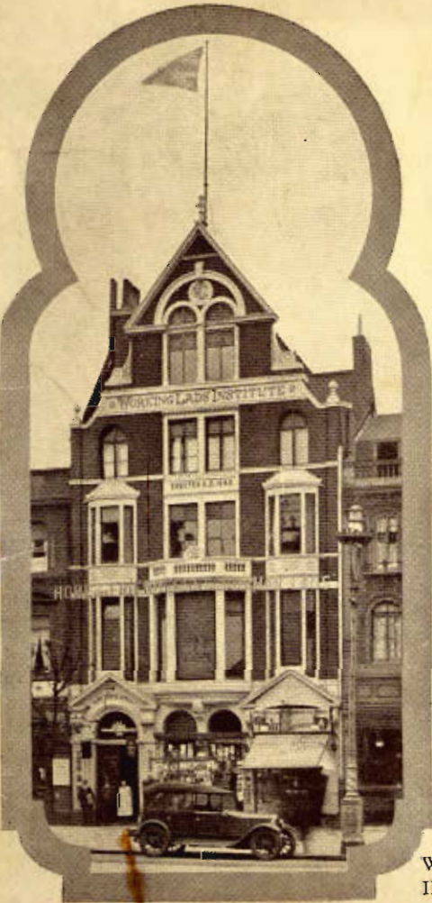
WORKING LADS' INSTITUTE AND HOME