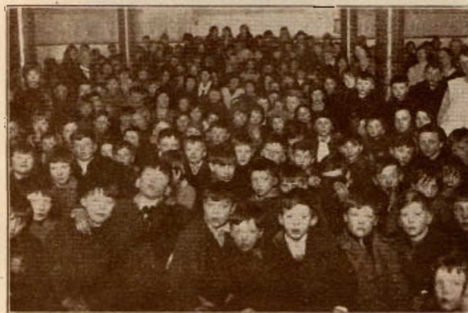
WATCHING THE CONJURER AT THE CHILDREN'S 'TREAT