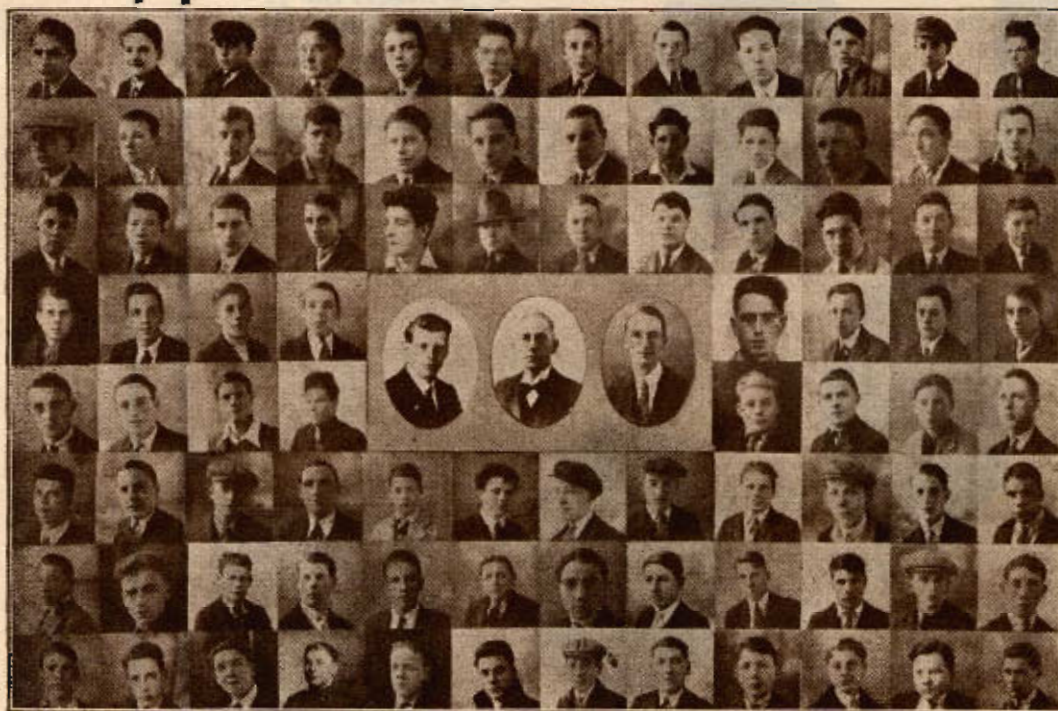
GROUP OF LADS ADMITTED DURING ONE YEAR