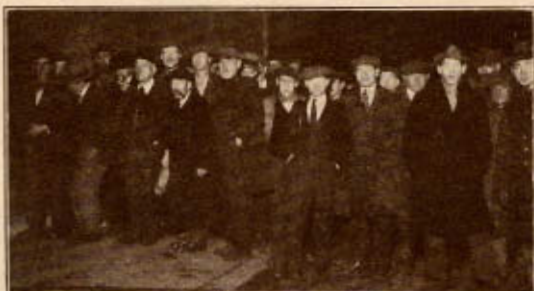
WAITING TO ENTER THE SHELTER