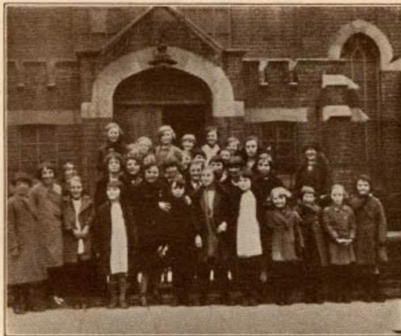
GROUP OF OUR CHILDREN, GUESTS OF BUSHILL, PARK SUNDAY SCHOOL