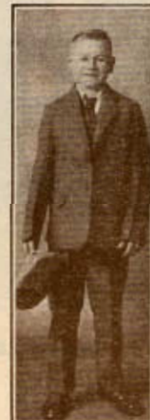
AS HE BECAME