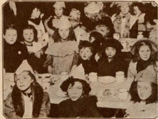
THE CHILDREN'S CHRISTMAS PARTY

The young people must needs be our particular care. Home life as you and I know it is unknown to them. They live in shocking tenements with conveniences and privacy at a minimum. Their playground is the street and the gutter.