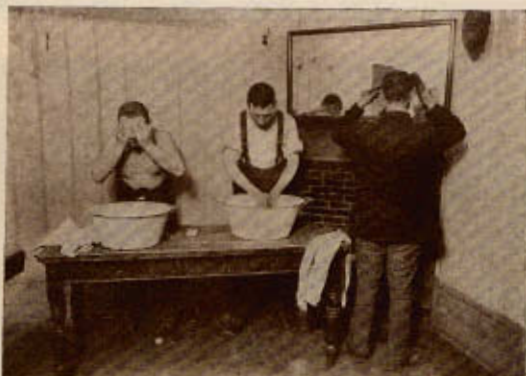
PREPARING TO FACE THE WORLD