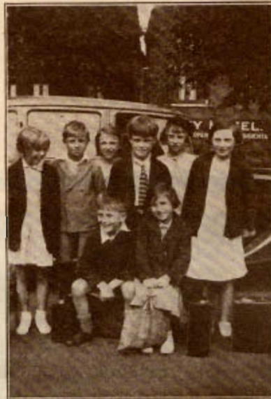
BEDFORD FRIENDS INVITE OUR CHILDREN TO THEIR HOMES

We do our best to counteract these conditions with Sunday School, Junior Classes, Cinema Entertainments, C.L.B., Scouts, Cubs, Gymnasium, Holidays and Treats.