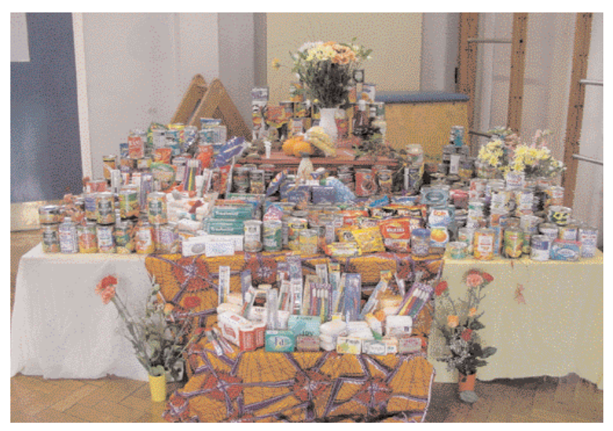
Harvest Gifts from one of the many Primary Schools that support us.

As the demand for our services continues to rise, we have been blessed with supporters that continue to increase their level of support. The amount of tinned food donated at Harvest time, from churches and schools, was the highest it has ever been. For the first year in our history, we will almost have enough tinned food to last the whole year without having to buy much at all.