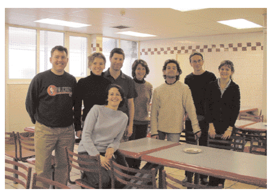
Volunteers from Chislehurst to work over Christmas

But, for the homeless, Christmas can be just another day. They can be as alone as they are for the rest of the year. The only differences will be that the city is a little quieter and it is colder than the summer. They are still alone, will not receive any cards and probably eat less, due to many centres closing for Christmas.