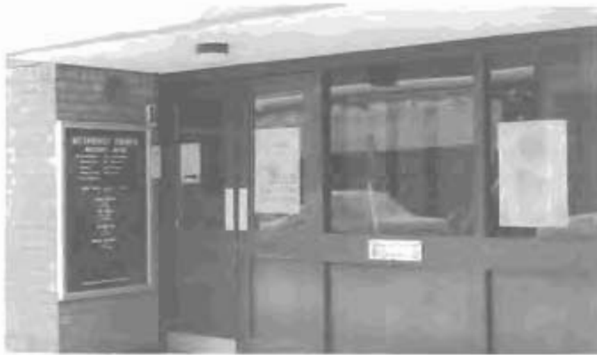
The old doors - RIP!

I hope that you will all have looked at the cover and noted the new doors we have had fitted to the Mission. These were really needed, because the old ones had rotted through years of being used for certain human needs amongst other things. I am sorry that they are pictured in the closed position, but I can assure you that they are always open for those who are in need.