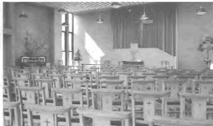
Find the changes?