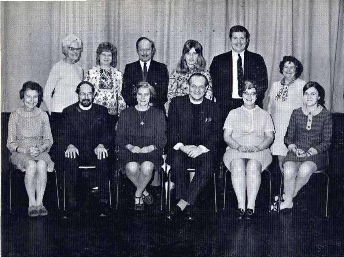
The White Chapel Staff