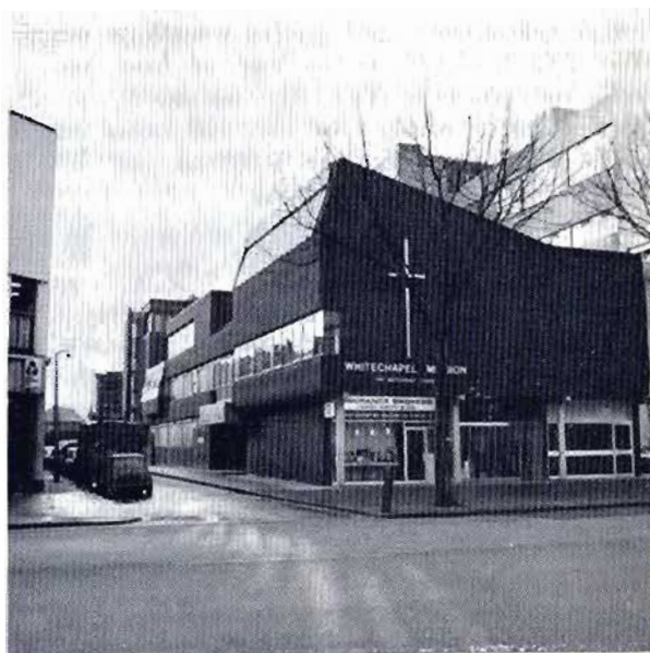
The exterior of New Mission Building

Our front cover picture shows H.H.R. Princess Alexandra and the people of Whitechapel at the Opening of our New Premises on 27th January 1971.