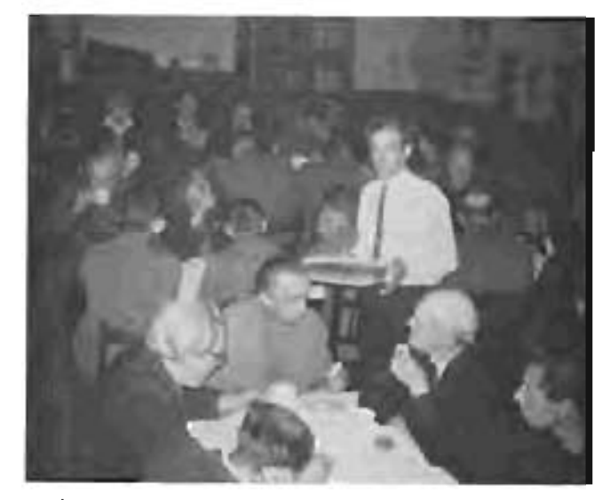
A few of those who regularly come to us for tea and sandwiches each Sunday

We have much to disappoint us certainly no queues for Sunday evening, but to see 50 men coming at 5 o'clock or before on Sunday afternoon for a 6d. tea is quite a sight. Some come because it's a very cheap tea, some because it's somewhere to sit and watch television in comfort, and half of this number will worship with us on a Sunday evening. Men from Salvation Army Hostel or Rowton House - some unemployed or unemployable, some getting a gleam that we are trying to offer more than tea and buns, and Christian fellowship does begin to mean something to some of them.