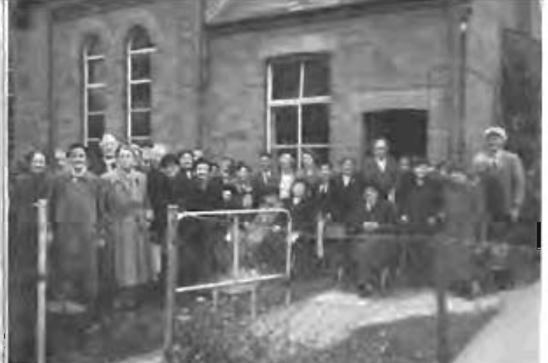
A "Favoured Few" who went to Pangbourne, Summer, 1957.

Another lady, a victim of arthritis among other serious ills, was moved into a ground-floor flat in a new building a few streets away from her former room. I sought her out so that she might go on a little trip that had been arranged. She could only walk inch by inch, with frequent stops to get back her breath and ease her legs, as we