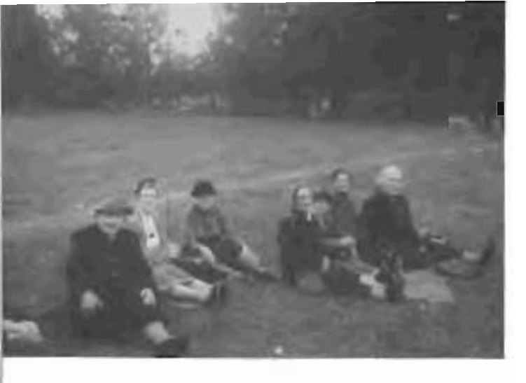
"A Breath of Fresh Air" — a group on a summer outing, 1957.