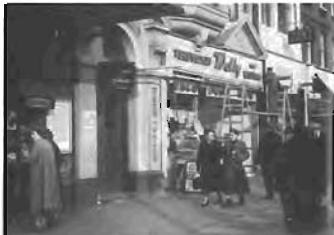
THE OPEN DOOR OF 279