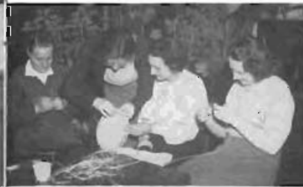
THIS IS HOW YOU START IT! (The Handicrafts Class)