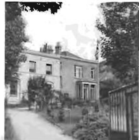
Holiday and Rest Home, Southend

OVER six hundred people have enjoyed the benefits of the old Home at Southend during the year. We have had a large number of letters of thanks, and appreciation has been expressed by some of the local authorities who have sent elderly and convalescent people to us. What is to happen to this property is not yet known. Real efforts have been made in recent months to clear up the whole situation down at Southend, but for lack of capital we have not yet arrived at a solution, and opportunities have been missed. We shall still endeavour to keep the Home going and fulfil its purpose, but with a little backing we could do much more and with greater effect. All the renovation and expansion throughout the Mission in the past seven years has been justified, and everything is on a sound basis so far as we have gone. There is much more to be done, and it can