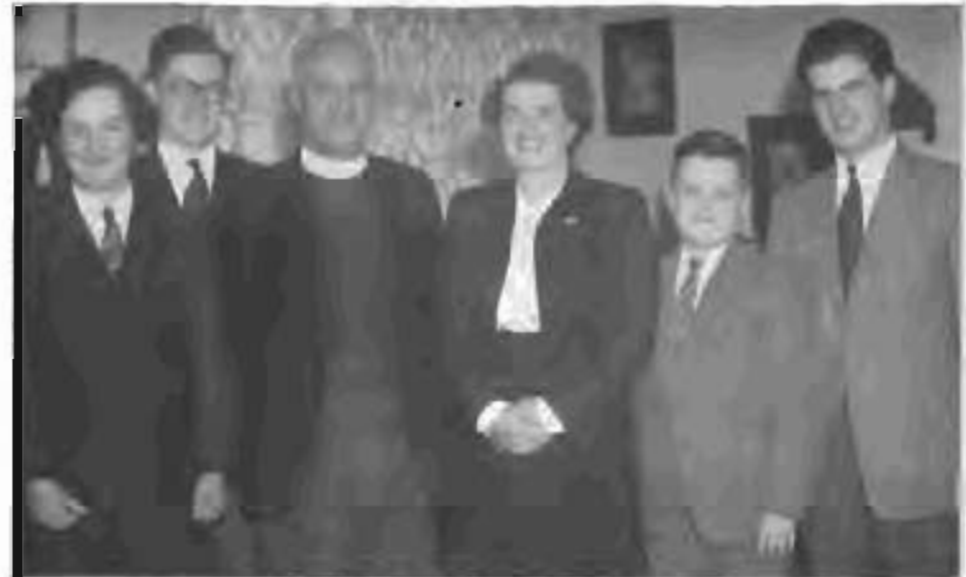
THE FAMILY AT 279