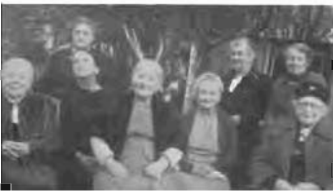
Enjoying the peace of Eventide (one absent)

The disposal of all the Mission's properties at Southend-on-Sea and the bringing together of the Holiday and Rest Home and the Eventide Home under one roof and with one staff would be a tremendous