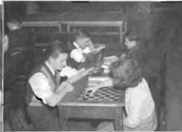
OUT OF MISCHIEF (The Youth Club)

Children, too, come to us from "Underneath the Arches". — To Scouts, Guides, Brownies, Teenies, Youth Club, Sunday School, Lantern Services and Young People's Fellowship! Some with loving parents, anxious at all times to set before them the best, escorting them to our meetings and fetching them home again; others are less favoured. A young doctor from the London Hospital who gives valuable help in the Sunday School remarked the other day on the general good behaviour and clean and happy appearance of our scholars, and indeed most of them are loveable, and we have hope of retaining them so long as they remain within reach of the Mission. Unhappily, in a sense, the young folk tend to move out of the area at the first opportunity and we have to be satisfied to know that we serve as a "nursery" for other churches in more salubrious neighbour-