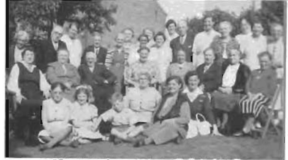
"Come ye yourselves apart and rest awhile" Mark 6 v. 31